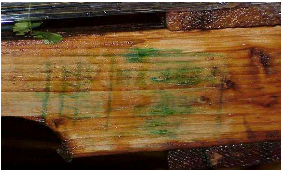
Illegible WPM Mark